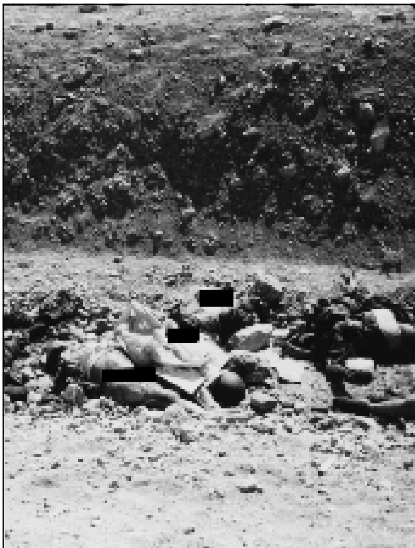
Document 2: Prisoners buried in shallow mass graves in summer 1988 after execution. Khatami was Khomeini's propaganda minister when such crimes took place.