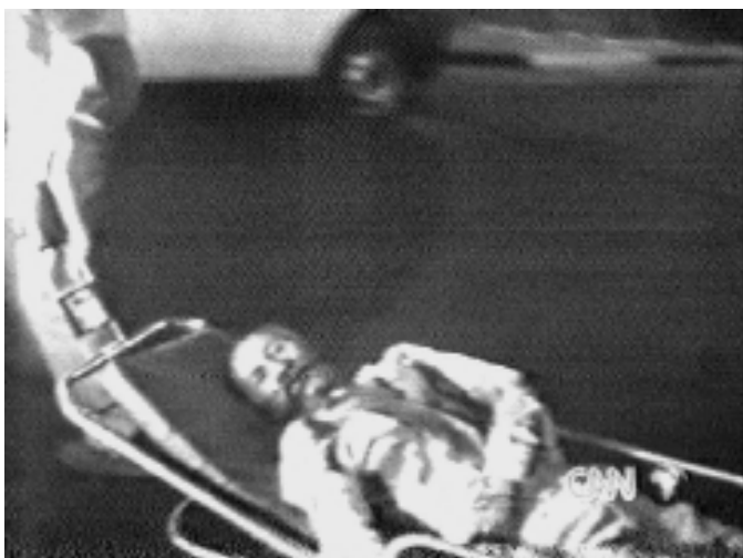
Document 4: A Mojahedin car destroyed in a bomb blast by the mullahs' terrorists in Baghdad on August 7, 1998 (top). An Iraqi cigarette-vendor, aged 65 (bottom), was killed in the blast, together with his 15-year-old son and a girl aged four. Eleven other Iraqi civilians were wounded. This was the sixty-fifth terrorist attack by mullahs' terrorist against Iranian Resistance in Iraq since 1993, 14 of them since Khatami became president.